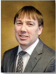
LES DANIELSON DISTRICT VI ALTONA MARKET BARRON MARKET